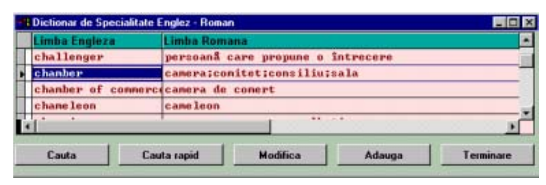
Figure 3. A specialized dictionary

provided for in the test. A bilingual specialized dictionary (English-Romanian) with more than 30.000 terms (items, notions) has been produced in the tested application.