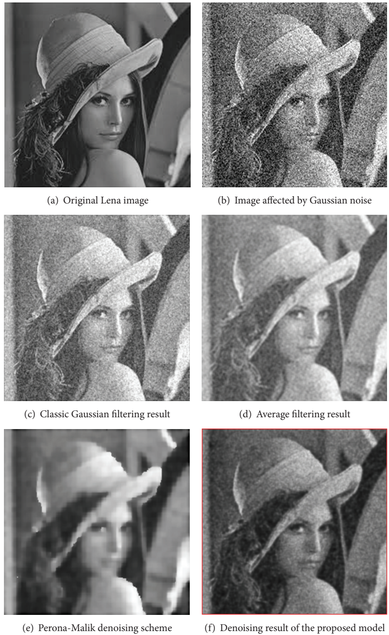
FIGURE 1: Gaussian noise removal results produced by our technique and other approaches.