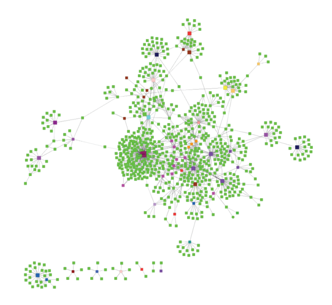
FIGURE 3: A diseases-related gene associated network. Green nodes are genes, and the nodes in other colors are diseases.