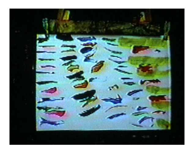
Figure 2: Example of pattern creation using paint colours

pink, purple." She repeated the set twice before beginning a new set of stripes (childinitiated episode-phase 2). Another child, Nicole, observed Ashleigh's painting and said "I'm going to be green, pink, purple." Nicole made four sets of a green, pink and purple pattern. She then painted lots of green stripes and then put orange stripes in between the green lines. Nicole made more AB patterns using orange/green and purple/yellow. Nicole then said aloud (to who-ever was present) "Look at my patterns" (see Figure 2). Nicole's participation in this event constitutes the response to child-initiated task (phase 3). From a distance, Mrs Jones (teacher) observed the children discussing their creations. Mrs Jones called out "Looks like you are doing some lovely art work", and continued inside the Centre. Mrs. Jones did not seem to be aware of the opportunity she had failed to capitalise on through not noticing the children's interest in mathematical patterning. Factors influencing this episode included Ashleigh and Nicole's knowledge of repeating linear patterns. The available paint and resources provided them with the opportunity to play and explore. Influencing factors such as the degree of teacher involvement and encouragement may have limited the potential of this activity however the children shared their knowledge and encouraged each other to participate in the experience.